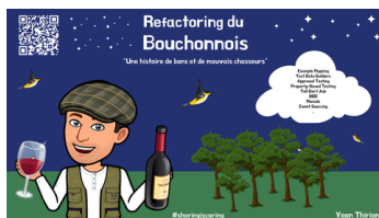
Refactoring du Bouchonnais

2 Calendars: 2023, 2024 Summer Craft Book